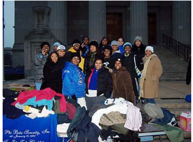
Tau Eta Zeta Chapter Members, "Heart for the Homeless"

The Community Service Committee would like to thank everyone for their continued support and hard work.