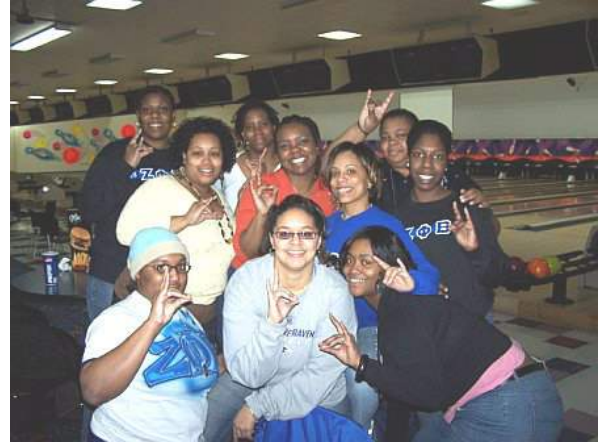
THZ Sorors, out for some fun at Woodlawn Lanes.