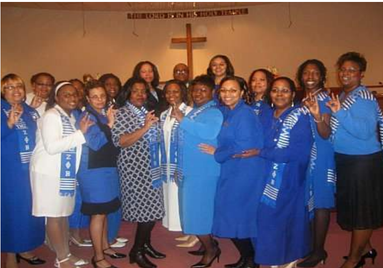
Tau Eta Zeta Chapter, Finer Womanhood Worship Service