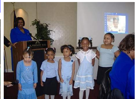
THZ's Pearlettes at Finer Womanhood Luncheon