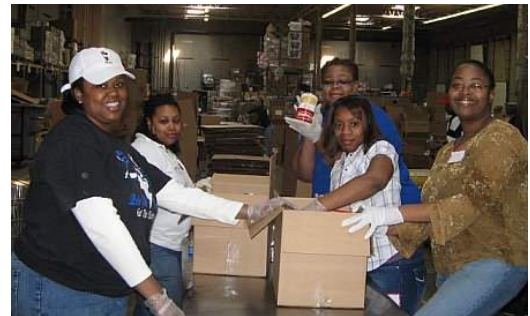
Tau Eta Zeta chapter members and friends volunteering at the Maryland Food Bank

On March 10th, Tau Eta Zeta chapter volunteered at the Maryland Food Bank where they sorted and boxed canned foods for the less fortunate. After completing this task, chapter sorors participated in “Pamper Day” where they were able to get facials and other beauty treatments.