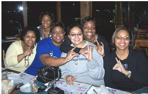
Dining at City View Grill