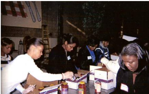
Busy volunteers at the Maryland Food Bank