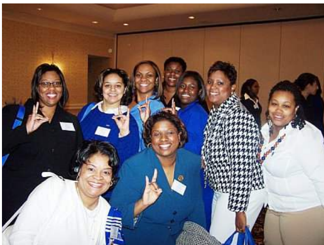
Tau Eta Zeta Chapter Members & Tau Delta Zeta Chapter Members fellowshipping at the conference.