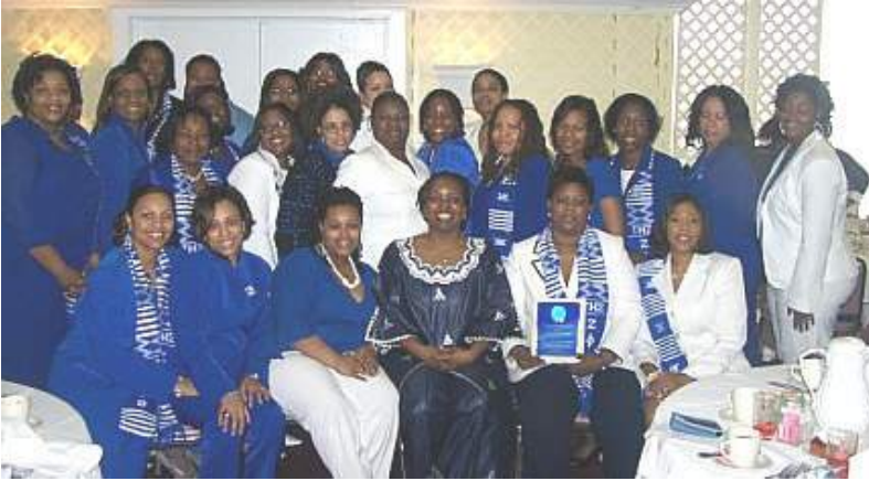
Tau Eta Zeta Chapter, Finer Womanhood Luncheon