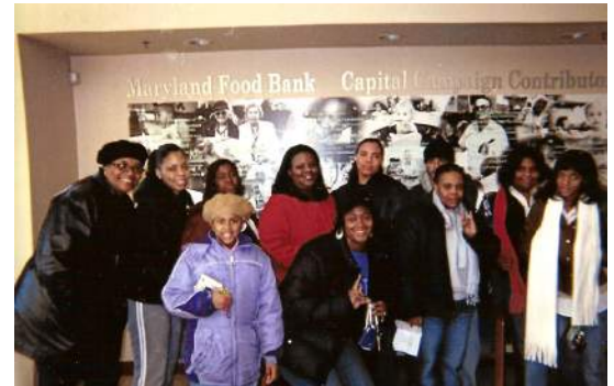
Volunteers at the Maryland Food Bank