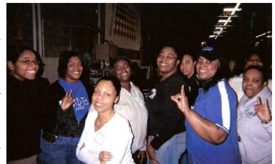
Chapter members & friends, taking a pause to pose