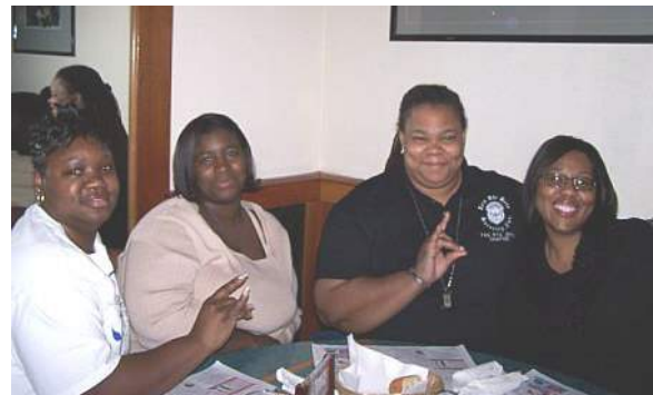
Smiling for the camera, City View Grill