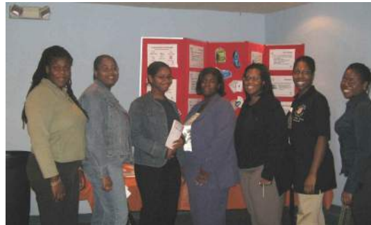
Z-HOPE: Disaster Preparedness 101