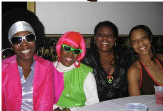
"Ol' Skool" meets "Nu Skool"