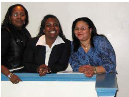
THZ's Invitational March 7, 2004