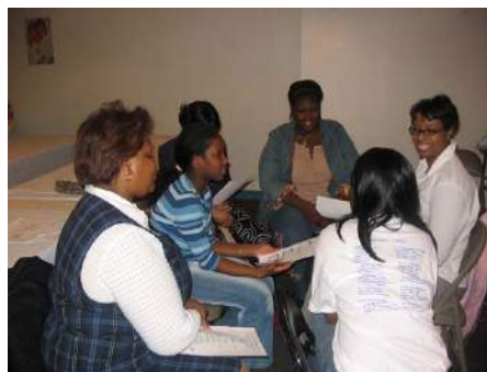
THZ's March Z-HOPE Workshop Sisterhood - The Ties that Bind