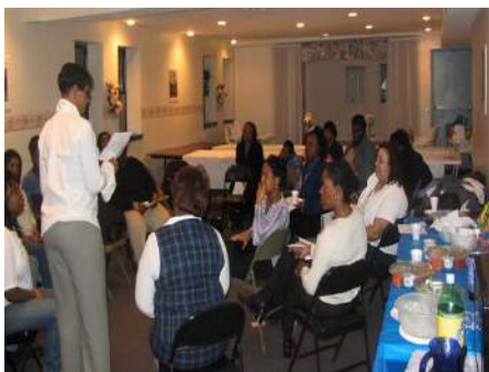
THZ's March Z-HOPE Workshop Sisterhood - The Ties that Bind