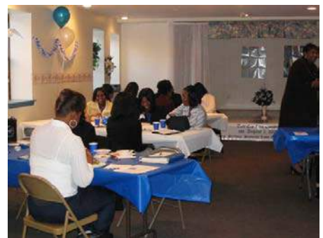
THZ's Invitational March 7, 2004