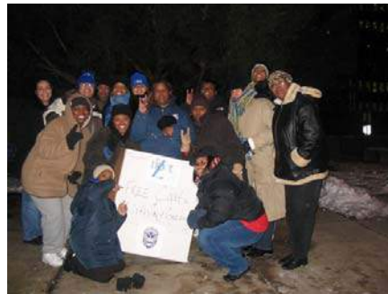
THZ's Warm Garment Drive January 31, 2004