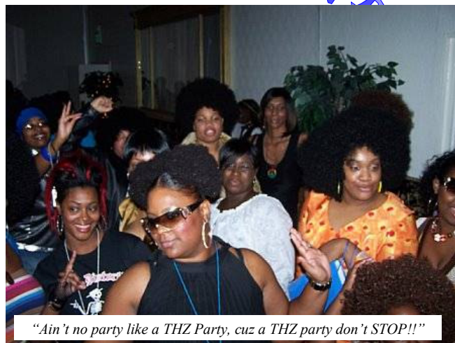
"Ain't no party like a THZ Party, cuz a THZ party don't STOP!!"

Be sure to buy a raffle ticket to win a trip for TWO TO LAS VEGAS!! (The winner will be announced during Ol' Skool 2 Nu Skool) Just ask any Tau Eta Zeta Member!!