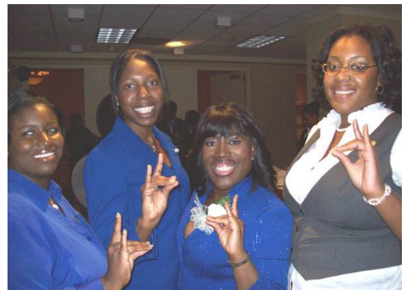
Tau Eta Zeta Chapter members pictured with Sheryl Underwood, the International Grand Basileus of Zeta Phi Beta Sorority, Inc.