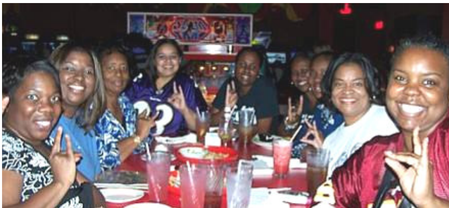
Tau Eta Zeta & Tau Delta Zeta Chapters at Dave & Buster's

The beautiful Sorors of Tau Eta Zeta and Tau Delta Zeta Chapters joined together for food, fun and a fabulous time at Dave & Busters on Sunday, September 28, 2008. Sorors were able to meet new sorors, share funny stories, cheer for their favorite football team and have a phenomenal sister bonding experience. This is and was a true representation of what Sister-