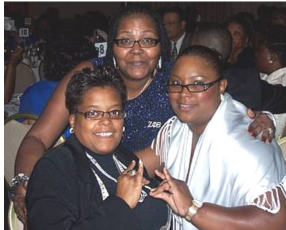
Sorors attending Alpha Zeta Chapter's 85th Anniversary

Gamma Zeta and Tau Delta Zeta Chapters. The evening culminated with dancing to a phenomenal live band and reminiscing with sorors from other chapters throughout the State of Maryland. It was truly an evening to remember!