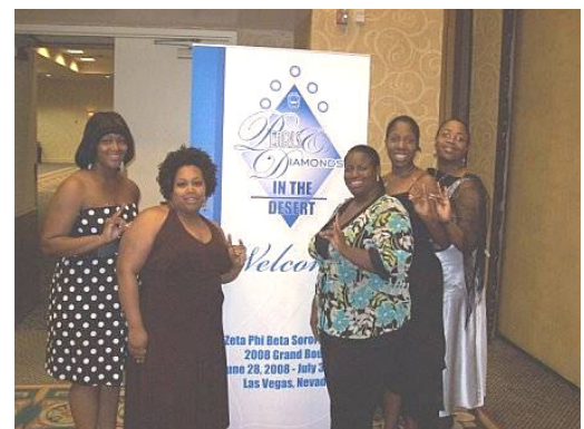
Tau Eta Zeta Chapter members after the Gala at Boule' 2008