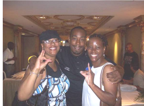
Sorors & Frat at Zeta Sigma's Crab Feast