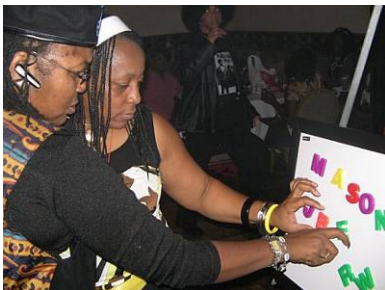
Soul Train Scramble Board