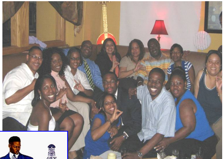
Blue & White Social Hour