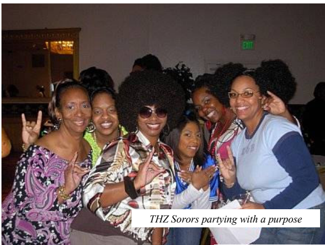
THZ Sorors partying with a purpose

For ticket information contact Yolanda at 410-340-5837 or Liset at 443-756-2773. You can also purchase tickets online at www.zphib-thz.org/pay/skhscholarship.html . The cost is $50 in advance and $55 at the door. Hope to see you there!!