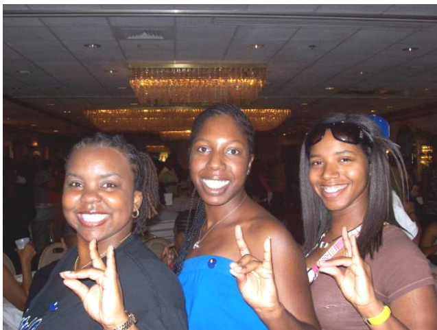
Tau Eta Zeta Sorors at Zeta Sigma's Crab Feast