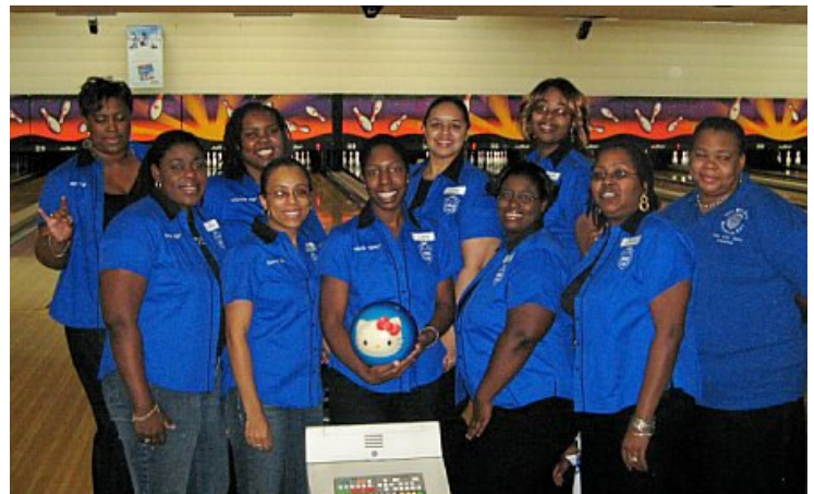
Pictured Right: Members of the Tau Eta Zeta "Alley Katz"