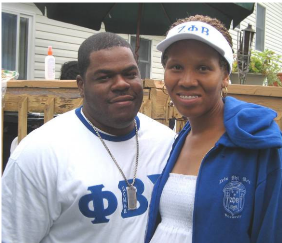
Tau Eta Zeta's End of the Year Cookout