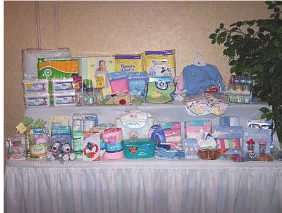
Items donated to start Tau Eta Zeta's Stork's Nest

For more information about the chapter's Stork's Nest, visit www.zphib-thz.org/nat_proj.html