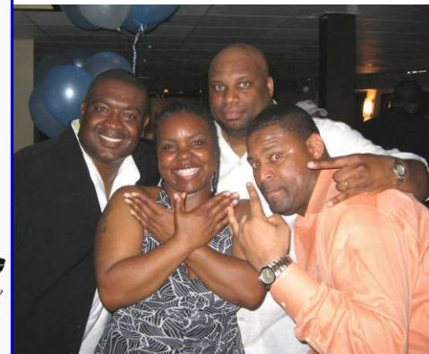
Phi Beta Sigma Boat Ride