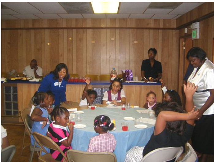
Pearlettes, with Advisors