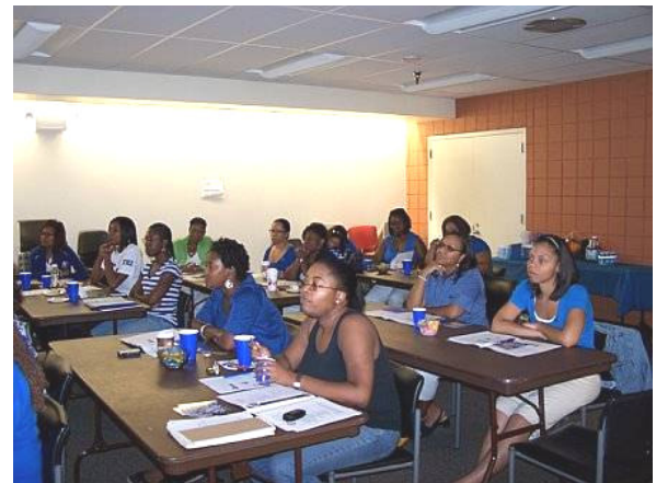
Sorors are listening to a presentation during the retreat