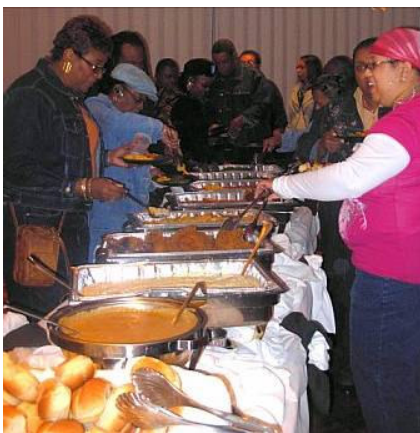
Lavish buffet courtesy of the Forum Caters

Be sure to buy a raffle ticket to win a trip for TWO TO LAS VEGAS!! (The winner will be announced during Ol' Skool 2 Nu Skool) Just ask any Tau Eta Zeta Member!!